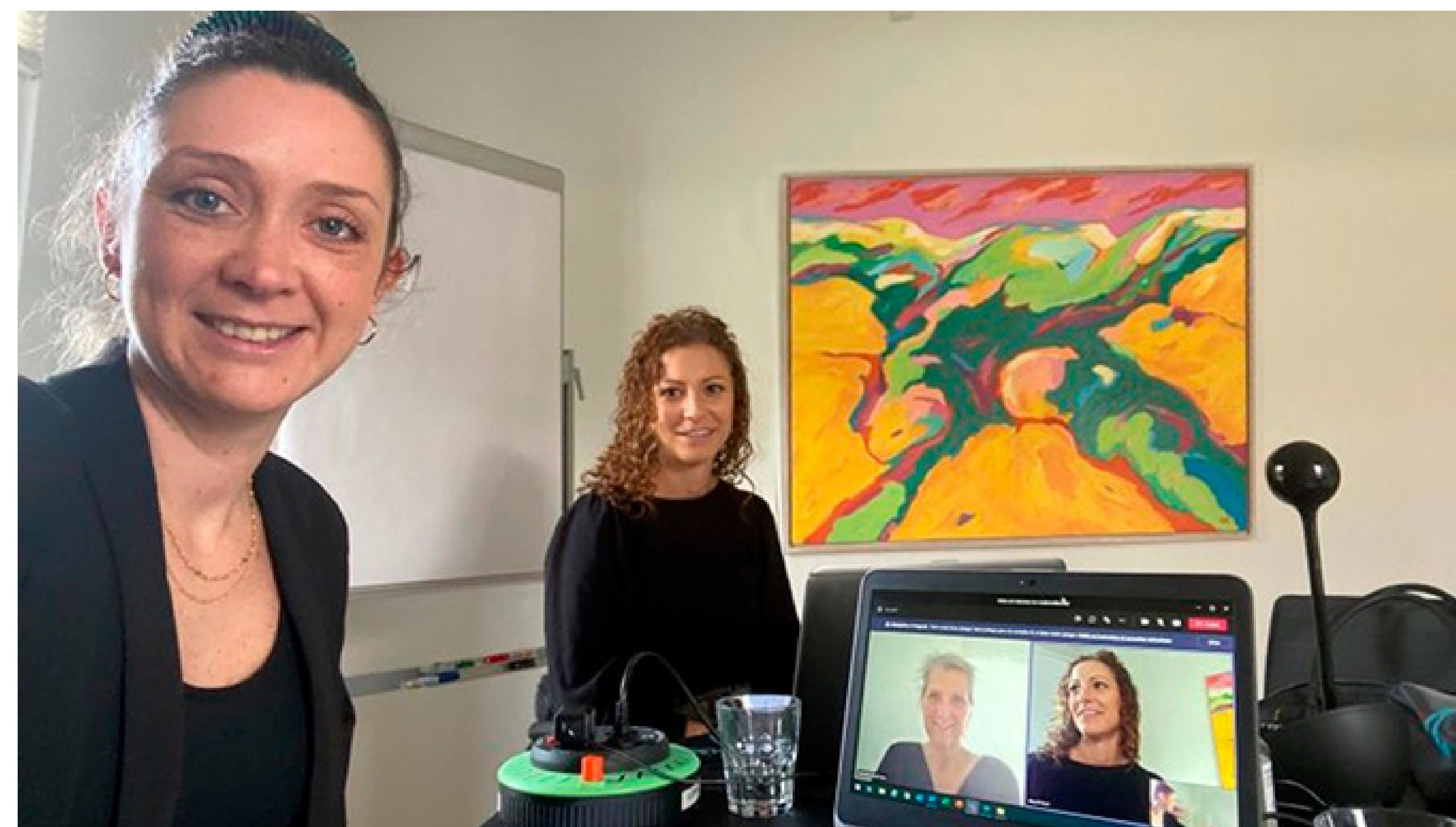
Figure 1: Researchers conducting an online interview with one of the municipal managers

To understand experience with medicine-related tasks, semi-structured, in-depth qualitative interviews with two-three municipal managers in ten different municipalities were conducted. The interviews were held online, recorded and transcribed verbatim before conducting a content analysis using NVivo version 2020.